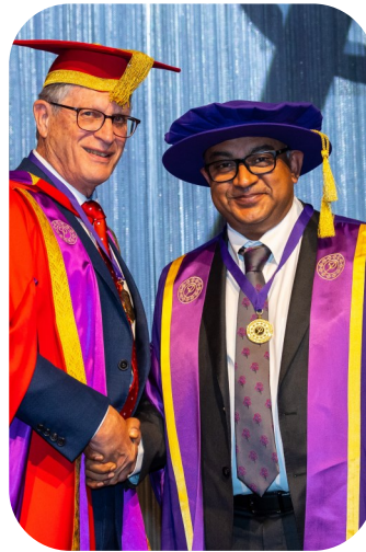
Dr Sriram Narayanan Award of Excellence in the Diagnosis and Management of Pelvic Venous Disease