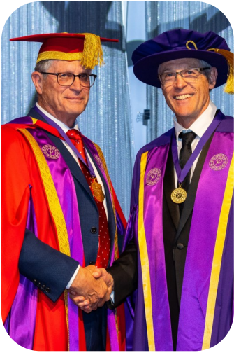
Dr Paul Hannah Award of Excellence for Training and Education in Phlebology