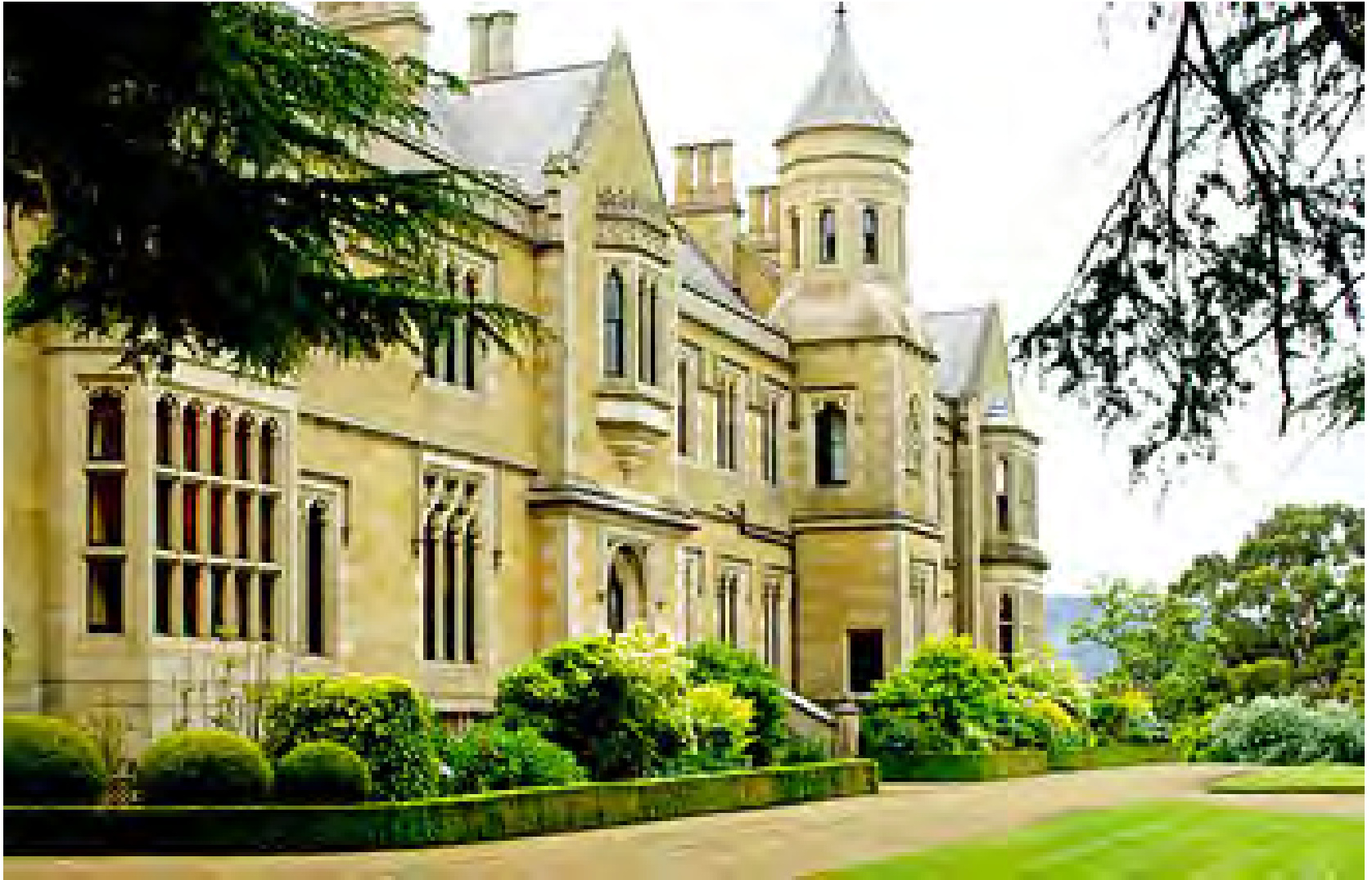
Government House, Hobart