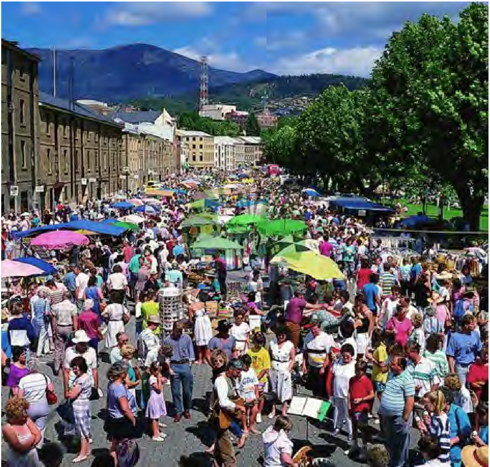
Salamanca Markets, Hobart